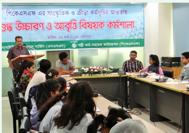
A partial view of the workshop on pronunciation and recitation

In the workshop, discussions took place on: the definition of recitation and its classification, presentation skill and ornaments, tone of voice practice, recitation performance, methods of standard Bengali pronunciation etc.