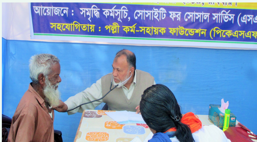
Doctor checks up health of a patient in the diabetes and medicine camp