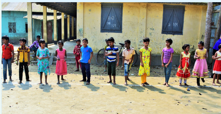
A partial view of the students participate in the sports

ENRICH education centers held annual sports for the students on 21 March 2019 in Binnafoir High School of Tangail Sadar Upazila. More than two hundred students from ten education centers of the ENRICH program participated in the sports financed by PKSF.