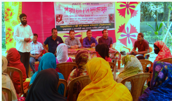
A partial view of the event on providing grant money to a beneficiary for hatchery set-up