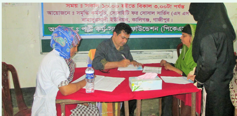
Doctor prescribes a patient in the physio camp