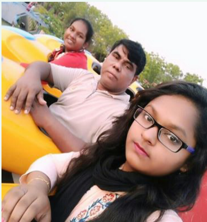
Two beloved daughters of Mujibur Rahman would never pose any picture with their father