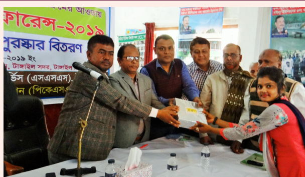
A girl receives prize in the ceremony

Two union-level youth conferences were held under the "Youth Society for Development" activities of ENRICH program. The first one was held on 4 February 2019 in the auditorium of Bahadurshadi office of ENRICH in Gazipur and second one on 5 February 2019 in Dainna Union Parishad Bhaban of Tangail.