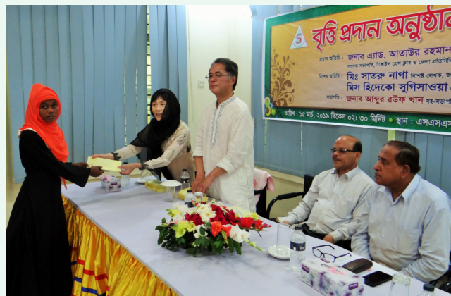
A student receives cash-money of the scholarship