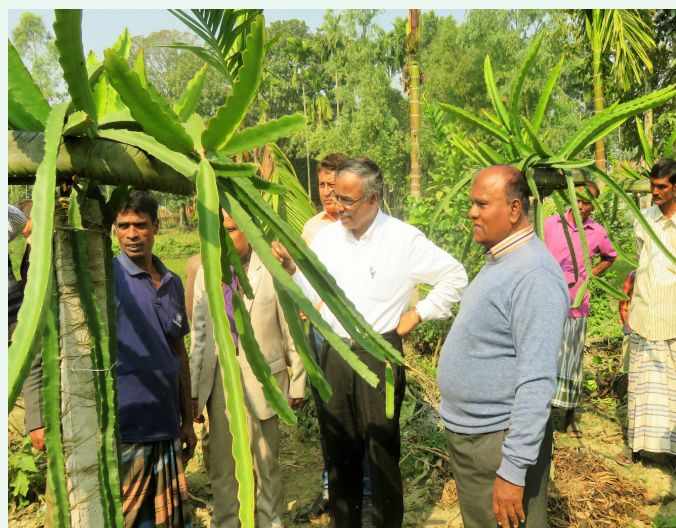
A team of the delegation pays visit to a dragon fruit farm